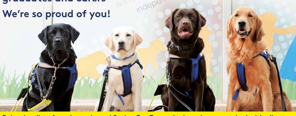
Below is a list of newly graduated Seeing Eye Dogs who have been matched with clients.

Congratulations to all our 2016 Seeing Eye Dog graduates and carers