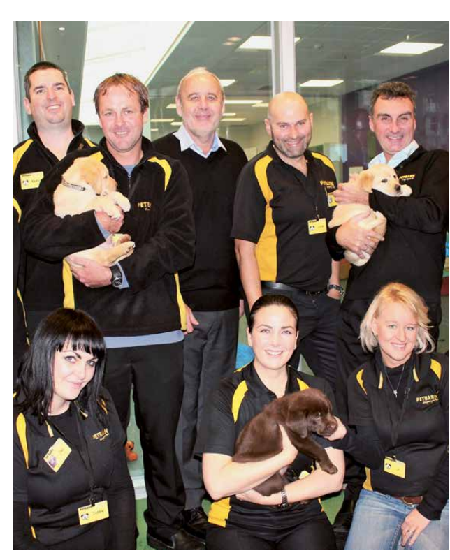
Petbarn staff with some of the puppies they helped sponsor.

The Petbarn store that raises the most money is rewarded with an exclusive tour of our state of the art Seeing Eye Dogs facility in Kensington, Victoria.